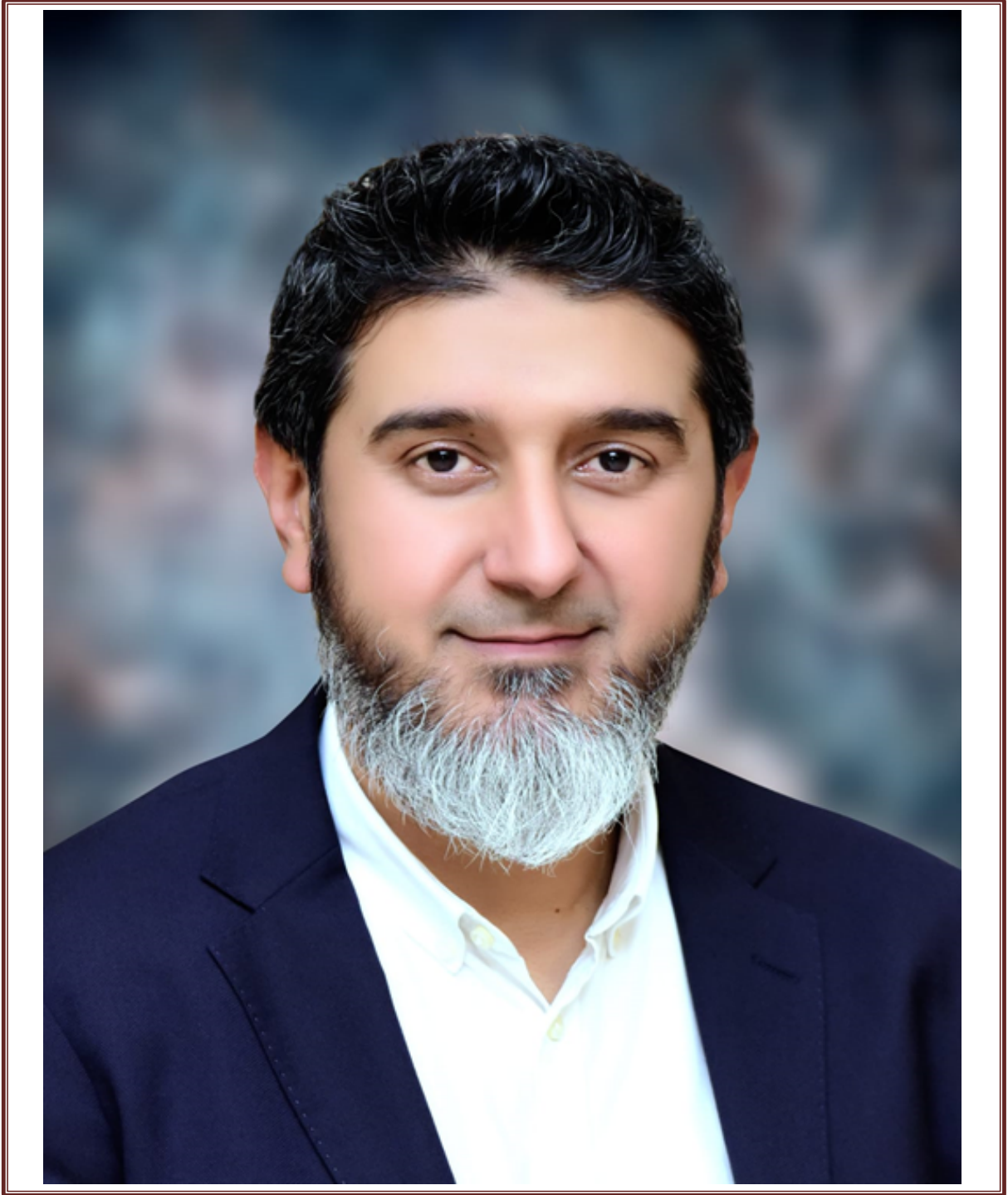
CHAIRMAN PAKISTAN TANNERS ASSOCIATION (CENTRAL)